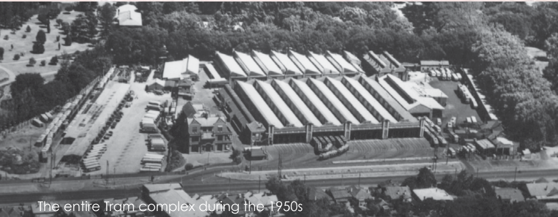
The entire Tram complex during the 1950s

this resulted in the demolition of the 1908 servicing bay. The Bicentennial Conservatory was constructed in this location. In 1992 a new bus depot was opened at Mile End and the Hackney depot was closed.