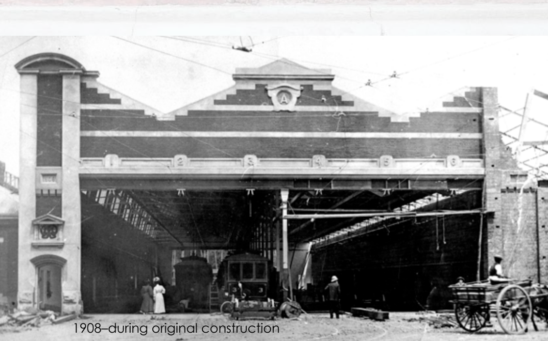
1908—during original construction

On the 9th March 1909, the new system was inaugurated ' amid public